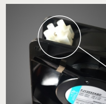
1 Connection mode FJ12032ABD