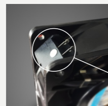
2 Connection mode FJ12032ABT