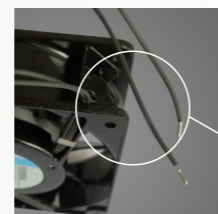
3 Connection mode FJ12032AB